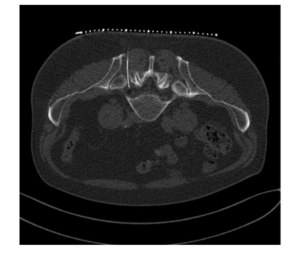
Needle tip is positioned close to the intraforaminal part of L5 nerve.